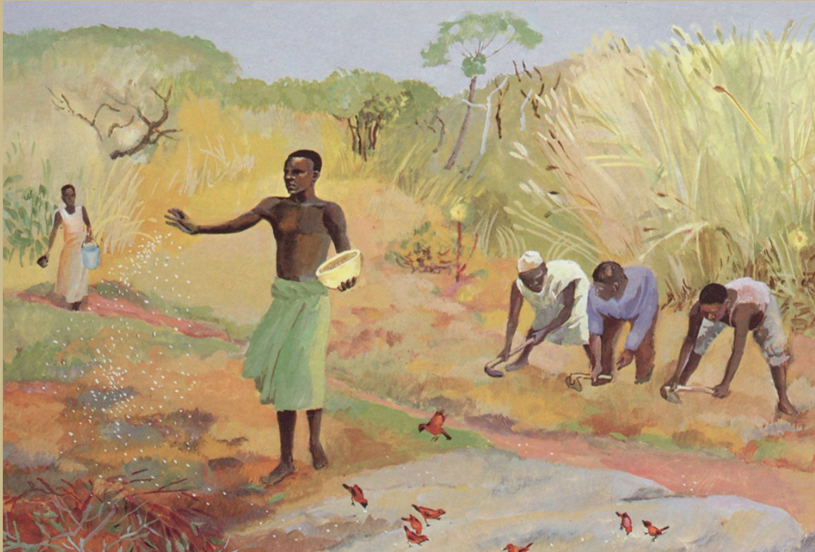
The parable of the Sower by JESUS MAFA