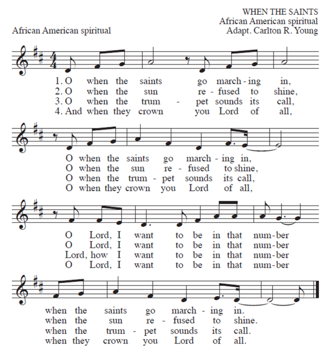
Adaptation Copyright © 2020 GIA Publications, Inc. • All rights reserved