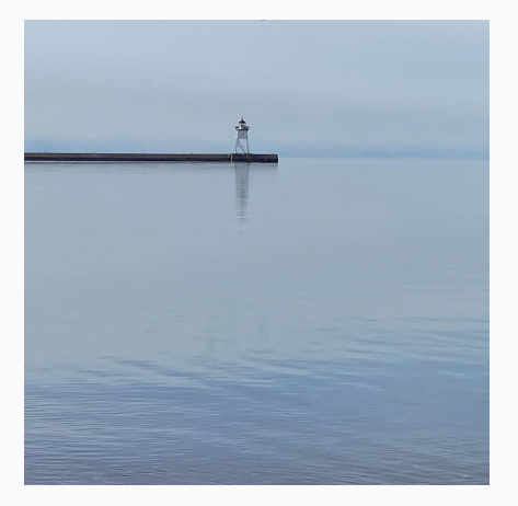
Harbor Watch: I am lead by still waters and my soul is restored.