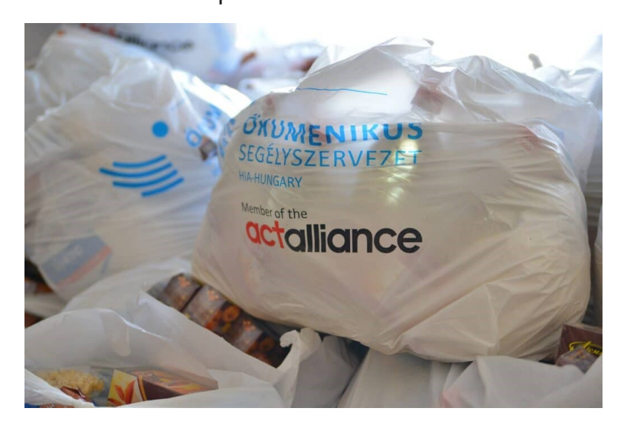
Relief supplies.

On February 24, the Russian military attacked Ukraine. Hundreds of thousands of persons have already sought refuge outside of Ukraine. Others have remained in the country but are displaced from their homes. The humanitarian crisis is accelerating in Ukraine and in neighboring countries as the violence escalates and the number of people on the move multiplies.